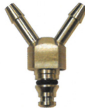
36513 Leak off connector 2 ways Y - Metal