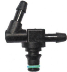
36514 Leak off connector 2 ways Y - Plastic