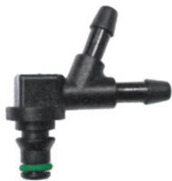
36511 Leak off connector 2 ways Y - Plastic