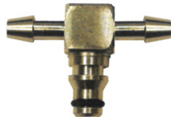
36512 Leak off connector 2 ways - Metal