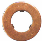
36521 X11-800-002-001Z 16 x 7 x 2,5 (Min. 100 pcs)