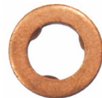
36523 X11-800-002-003Z 14 x 7,5 x 2 (Min. 100 pcs)