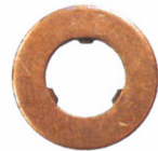
36522 X11-800-002-002Z 15 x 7 x 1,5 (Min. 100 pcs)