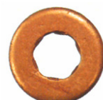
36524 X11-800-002-004Z 16 x 7 x 2,5 (Min. 100 pcs)