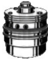
35510 3411711 * Metering P&B assy Male configuration