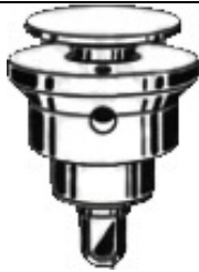
35500 3034407 Fuel Control Valve