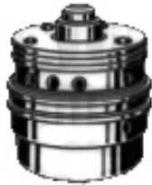
35505 3072450 * Metering P&B assy Female configuration