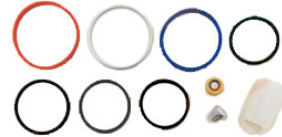
35515 Kit 26105 L10, M11