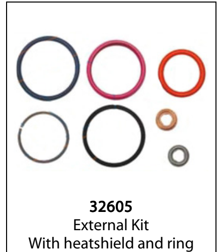
32605 External Kit With heatshield and ring