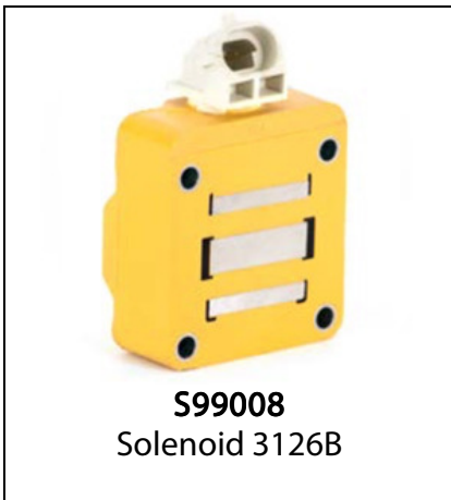
S99008 Solenoid 3126B