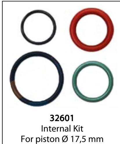
32601 Internal Kit For piston Ø 17,5 mm