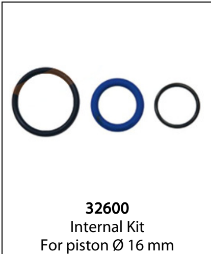
32600 Internal Kit For piston Ø 16 mm