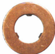
36522 X11-800-002-002Z 15 x 7 x 1,5 (Min. 100 pcs)