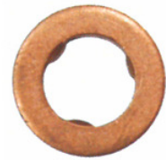
36523 X11-800-002-003Z 14 x 7,5 x 2 (Min. 100 pcs)