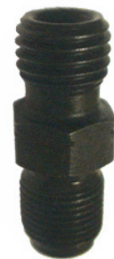
36616 X11-800-002-016Z/017Z Fitting + Microforated tablet