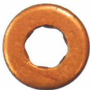
36524 X11-800-002-004Z 16 x 7 x 2,5 (Min. 100 pcs)