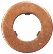
36521 X11-800-002-001Z 16 x 7 x 2,5 (Min. 100 pcs)